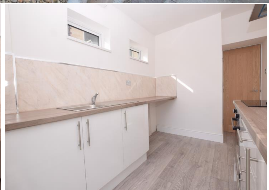
Viewing Advised No Onward Chain