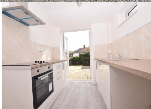
Well Presented Popular Area