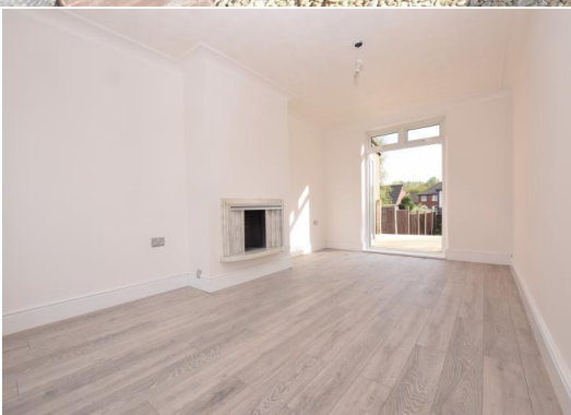
Three Bedroom Semi-Detached